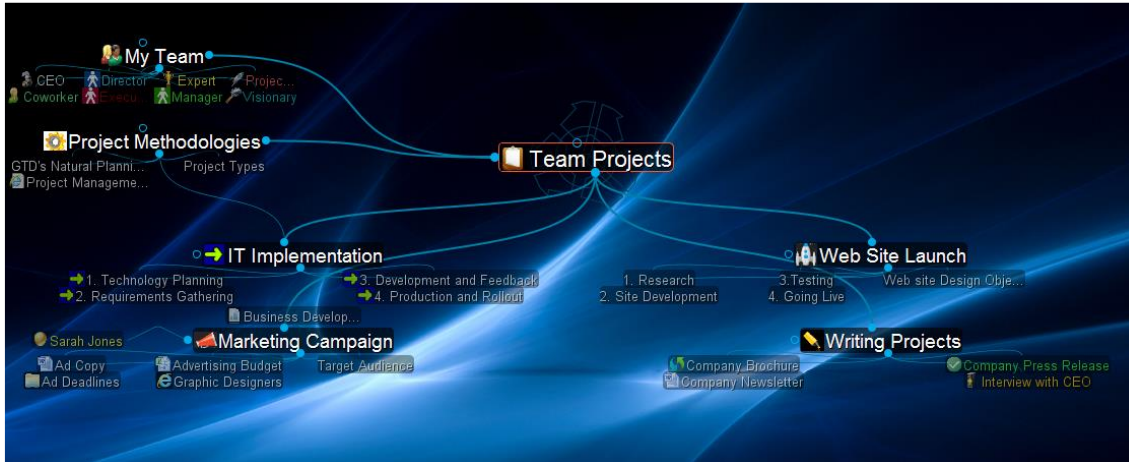
Figure 3. Project representation in TheBrain

Common items to include in a project space upon creation include: