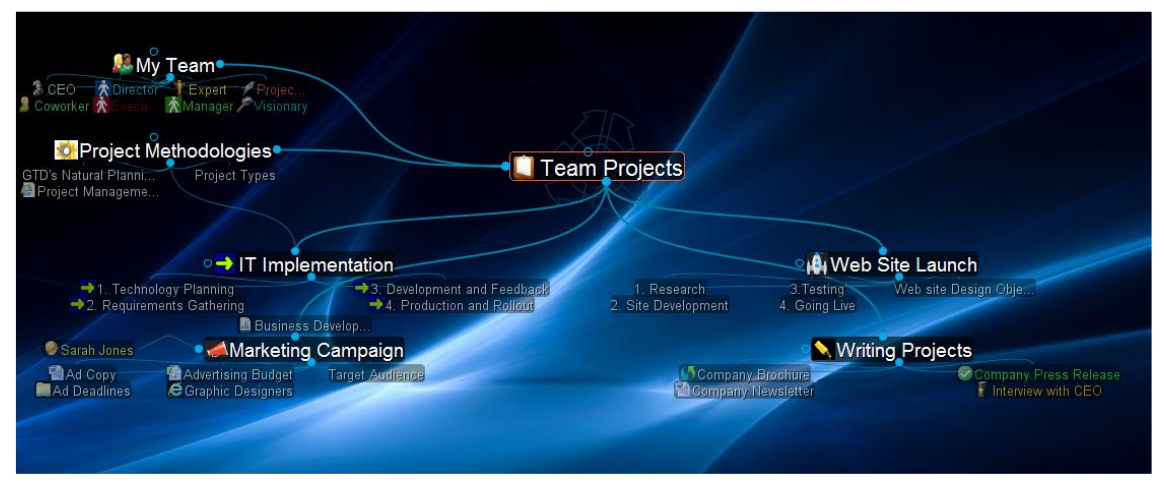
Figure 3. Project representation in TheBrain

Common items to include in a project space upon creation include: